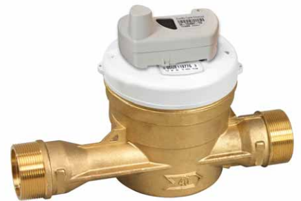
EverBlu Cyble Enhanced fitted on Commercial and Industrial water meter