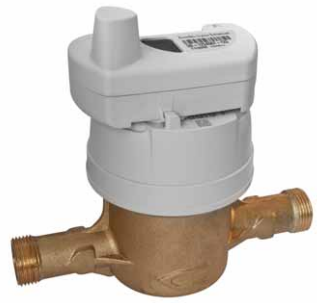
EverBlu Cyble Enhanced fitted on Residential water meter

The EverBlu Cyble Enhanced is suited to various applications for residential, commercial and industrial uses.